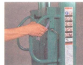
Easy Lowering by pulling lever Deadman design for safety (Manually Operated Models)