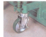
Polyurethane Wheels (All Models)