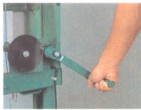
Option Quick Lifting Device (Manually Operated Models)