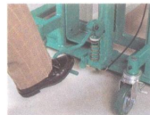
Easy Lifting by pumping pedal Pedal can be folded (Manually Operated Models)